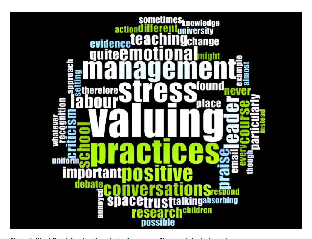
Figure 2. Word Cloud showing the relative frequency of key words in the interview

path-goal theory. In relation to 'valuing practices', Iszatt- White (2009, p. 455) identifies that "'valuing practices' are inherently communicative, and by their nature, embedded in the day-to-day work of leadership". Through coding of the transcript, these words were explored further in context in order to compare the participant's responses to this theory.