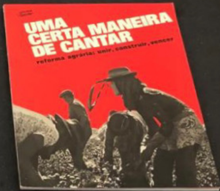
Uma Certa Maneira de Cantar - Reforma Agrária Uma Certa Maneira de Cantar - Reforma Agrária Uma Certa Maneira de Cantar - Reforma Agrária Uma Certa Maneira de Cantar - Reforma Agrária Uma Certa Maneira de Cantar - Reforma Agrária