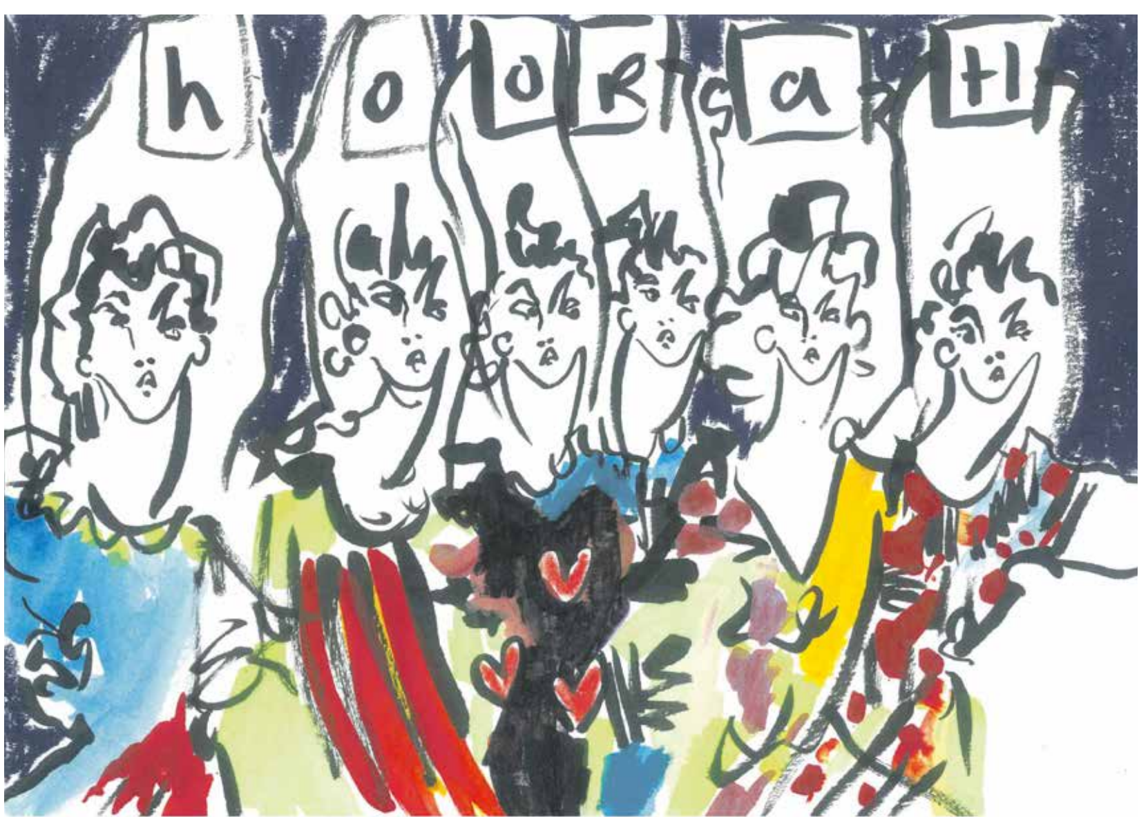
Hoorah - Happy New Year to Some Important People. January 2015