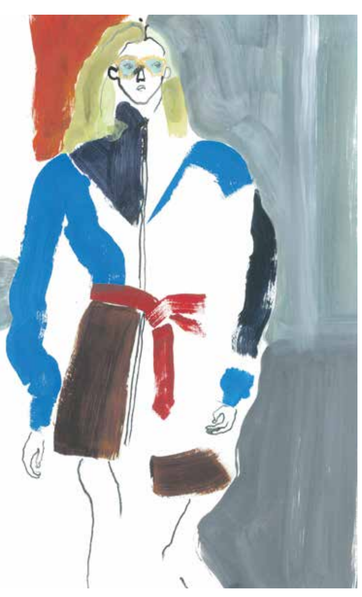
Louis Vuitton (A/W 2014) for AnOther Magazine