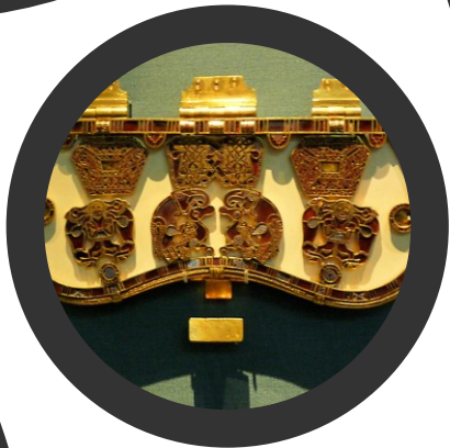
King Raedwald of the East Angles 7 th century AD