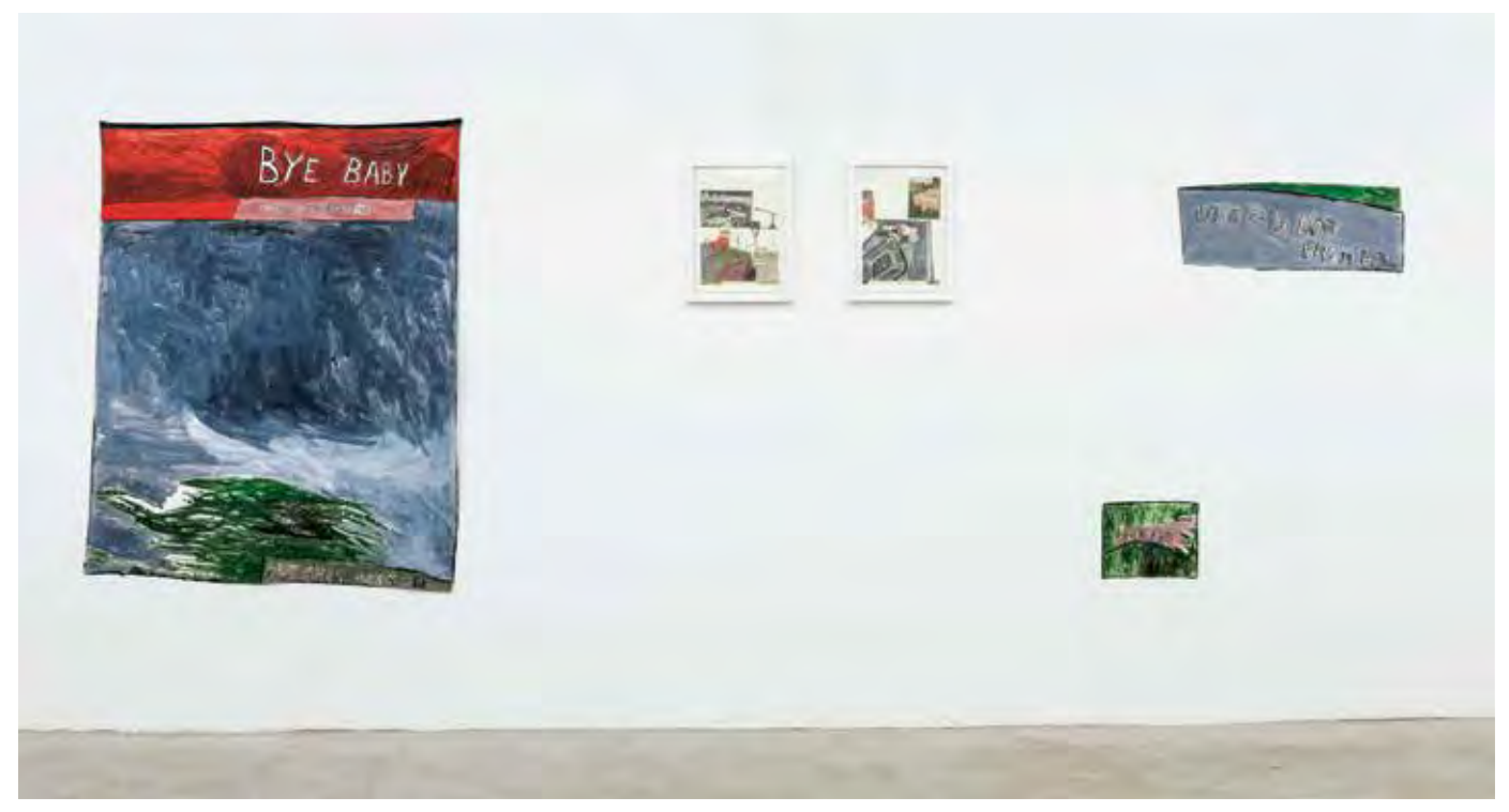
McQ store installation

The illustrations that Jacotey produced for McQ fit seamlessly into her wider body of work, but they also highlight the possibilities for narrative-based exploration within fashion drawing.