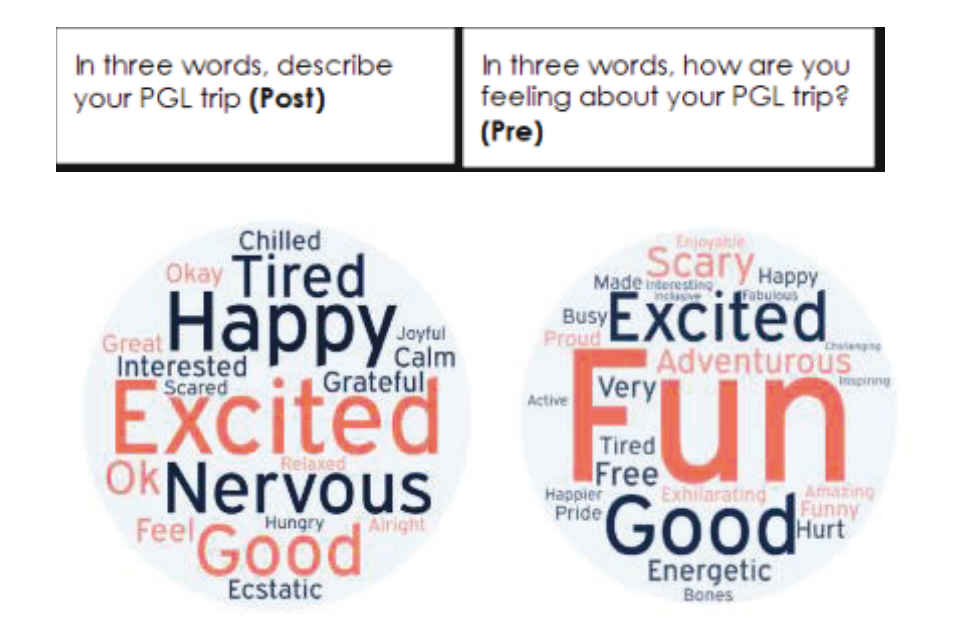
Figure 3: Student responses to describing their trip in 3 words, pre and post.

The additional five students' feelings on the trip prior to and following the trip are included in the word cloud listed below (Figure 3).