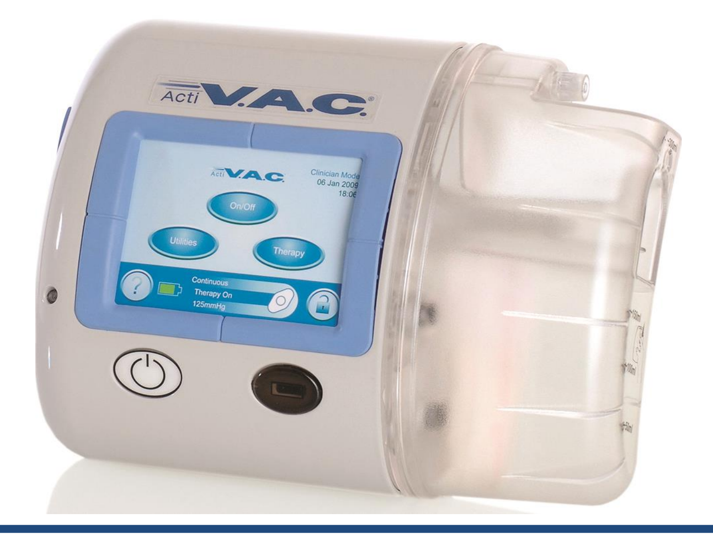
Figure 1. The latest V.A.C<sup>®</sup> therapy system for ambulatory patients (Activac)

The management of diabetic foot wounds is a continuing battle for health services and therefore any intervention that promotes healing and possibly prevents the need for amputation could be extremely valuable.