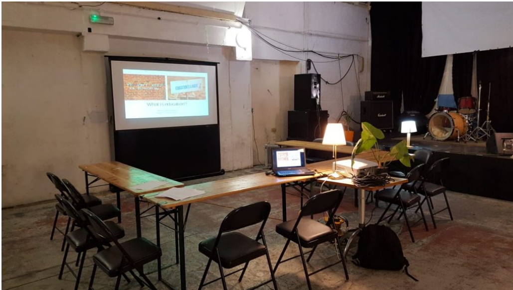
The classroom used in the first term

process. This situation hinders the student-teacher relationship and leads to tension and discord. The teacher often seeks to encourage students to leave aside worries about their grades and to provoke discussion based on independent scrutiny, while students, concerned with their future security and debt burden, understandably seek shortcuts to obtaining their degrees. At the same time, this pragmatic approach also becomes a mode of behaviour among academics, and puts those who resist conformity in a difficult position. Consequently, we can witness how experienced academics, who are otherwise known for their 'oppositional' stances, get ensconced in their positions, take short-sighted and self-interested positions, and tend to ignore the rights violations and raging class struggles in their own campuses.