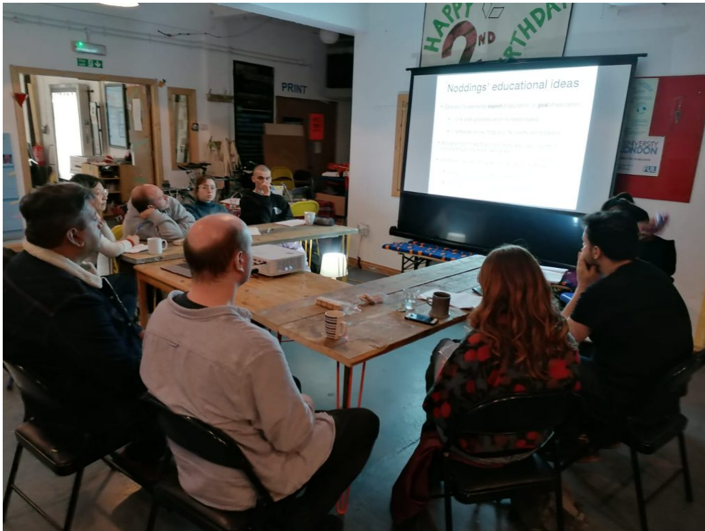
A lesson in session

to make it possible for students to communicate their needs to us and jointly consider sensible solutions.