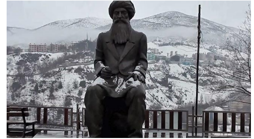
Seyid Riza statue