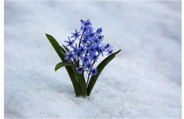
Snowdrop in Dersim: Solitary, yet rooted and defiant

*The need to 'level up' must be borne in mind