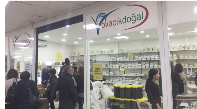
Customers visit an Ovacik store in a picture uploaded Oct. 31, 2018.

Led by Turkey's first and only communist mayor, the small town of Ovacik boasts a flourishing farming cooperative whose organic products have taken customers across the country by storm.