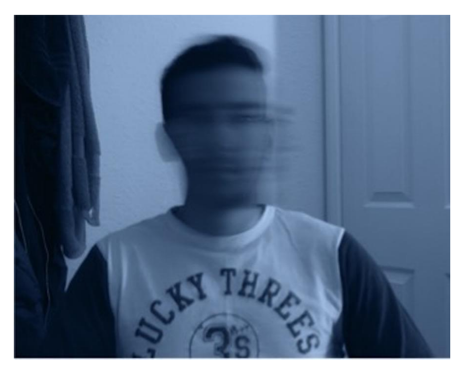
Figure 1. Caught in motion, Photography, Luke Willoughby, 2015

Figure 1 shares Luke's exploration of identity and perception through photography. As with the moving image, changemakers are perceived in different ways as situations and problems around them change and unfold. Caught in motion plays with this. The image lacks clarity in facial expression. The emotion portrayed is difficult to perceive. The object's focal point is unclear, as is the identity and thought of the character. The t-shirt's slogan emphasises probability, and probability as a concept suggests multiple possibilities. Changemakers look for multiple solutions in order to make a positive impact choosing a strategy for the addressed challenge. These inferences may be challenging to read, yet where cognitive progression is concerned it does not matter if these components are not immediately accessible because the image provided the artist teacher a visual voice (Heaton, 2014a). Art has a transformative power to alter social perception (Wehbi, McCormick & Angelucci, 2016), which can be true for viewer or artist. In this case it is artist cognition influenced by changemaker principles that is being developed through engagement in art practice. Our artist teachers experiment with changemaker ideals through research and making. They identify problems to be explored and forge potential solutions. This, in turn, develops their awareness of social justice art education.