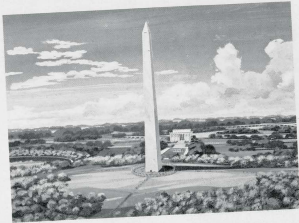
Front cover of the 1965 'For A More Beautiful Capital' brochure, found in a dumpster in Martin Luther King Jr Memorial Library during the filming of Hawk & Dove .