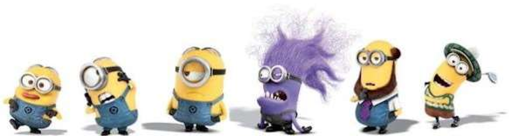
Bachelor Master PhD Postdoc PI Emeritus Prof